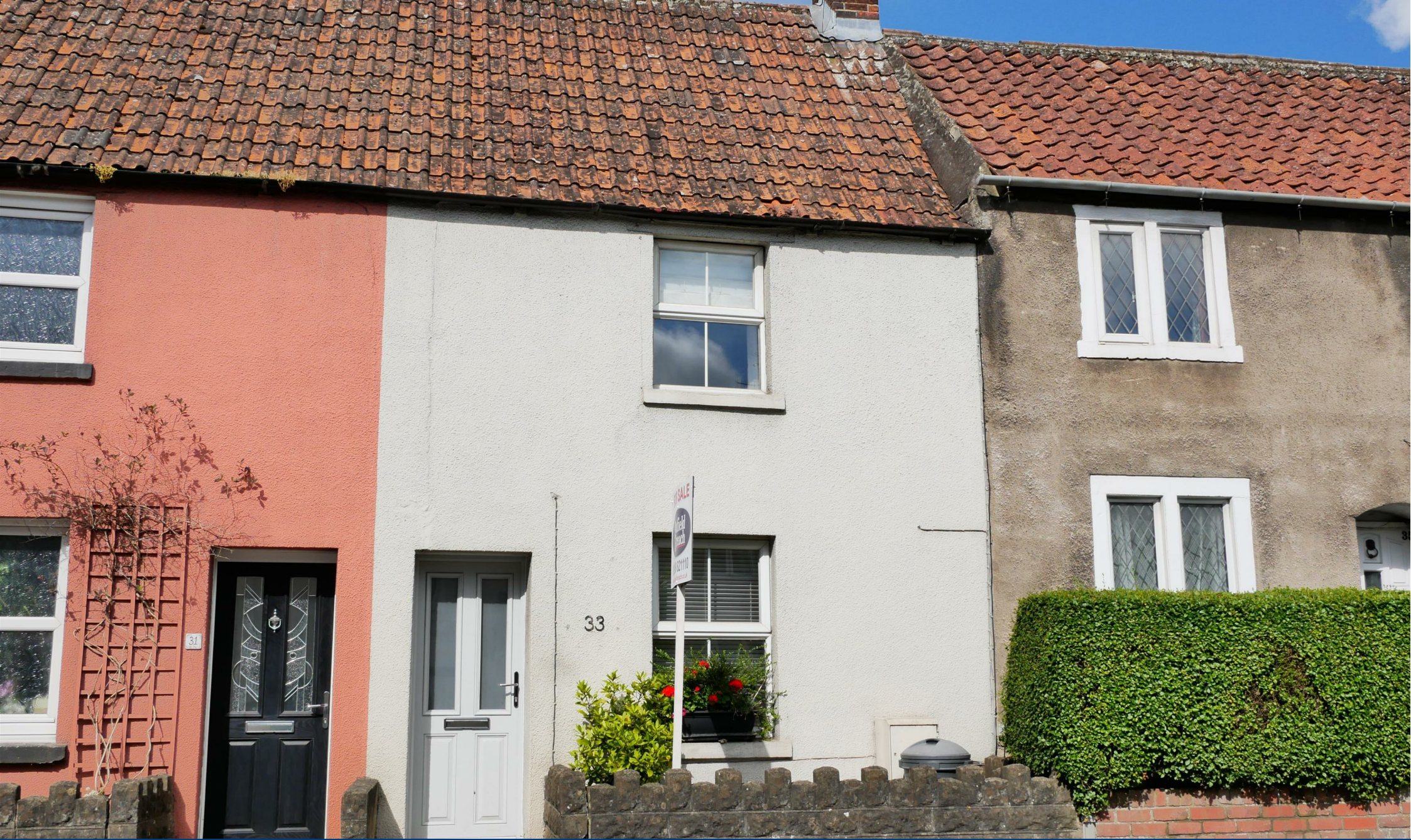
North Street, Calne £215,000